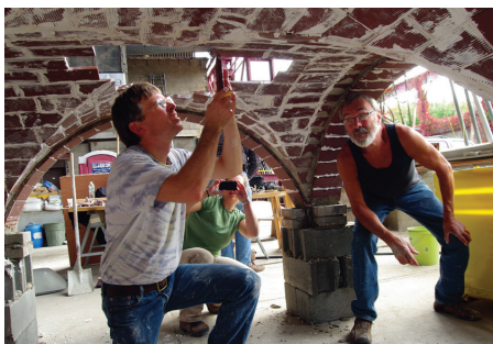
Constructing vaults at the Hands-On Construction Workshop of Guastavino Thin Tile Vaults, 2013 APT Annual Conference, New York