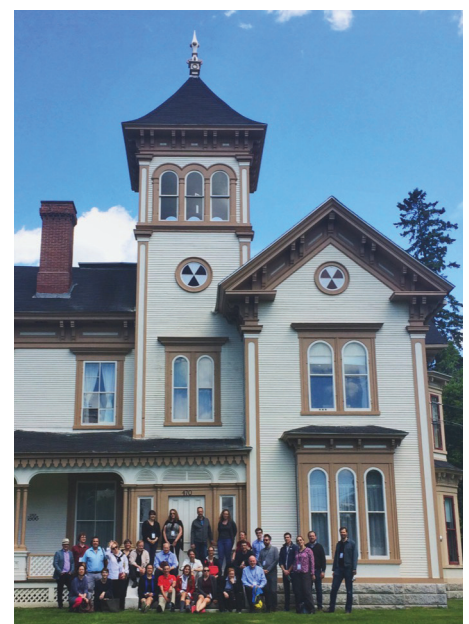
Appalachian Granite Workshop at Butters House (Maison Butters), Stanstead, Quebec, 2018