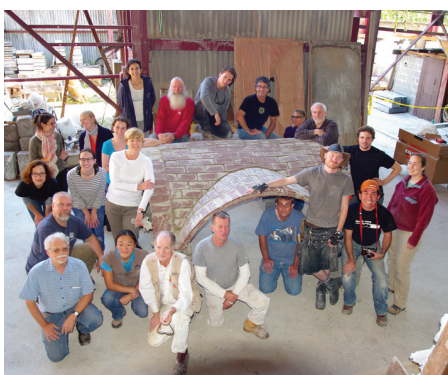
Participants at the Hands-On Construction Workshop of Guastavino Thin Tile Vaults