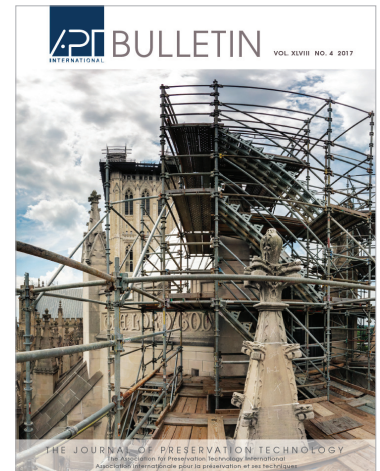
APT Bulletin: The Journal of Preservation Technology

APT has also created the Building Technology Heritage Library (BTHL) , a digital archive of important out-of-print materials on historic building technology and construction hosted by the Internet Archive. The archive draws from trade catalogs and other publications in public institutions and private collections. Historic materials are added to the archive regularly, and all content is copyright-free. The archive is a valuable research tool for design professionals, building conservators, and preservationists.